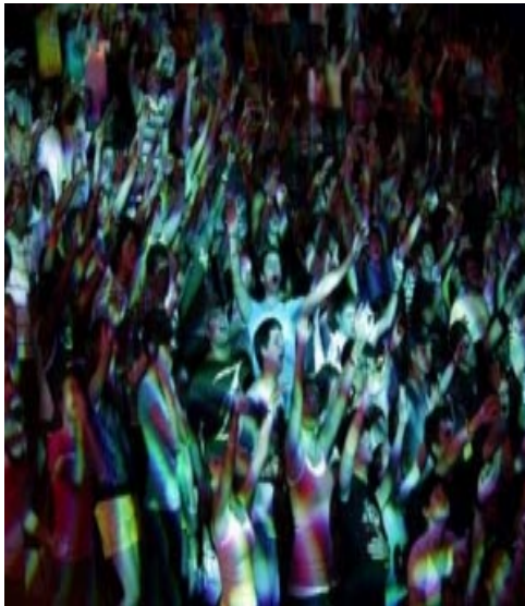
Here is a picture of a Christian mosh pit:

http://www.youtube.com/watch?v=CTbUqSjEb1E&feature=related