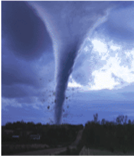
OPEN UP THE HEAVENS